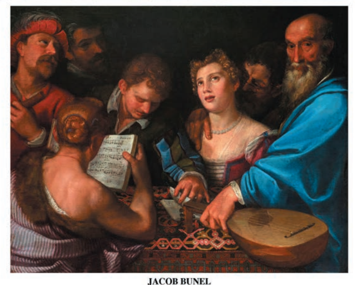
Blois 1558 - Paris 1614, French School A Group of Musicians rehearsing in an Interior Oil on Canvas, 36 7/8 x 46 1/2 inches (93.5 x 118 cms)

Signed BUNEL on the Musical Score and dated ..[15]91